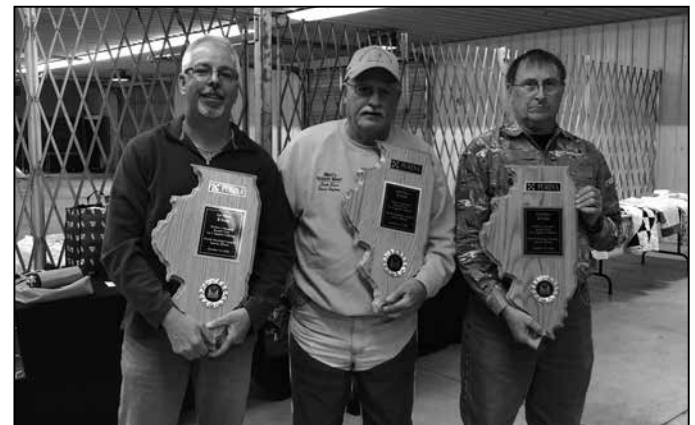
Shriners' Trial, Saturday – B field