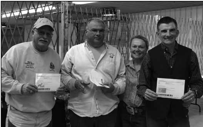
Illinois Benefit – C field