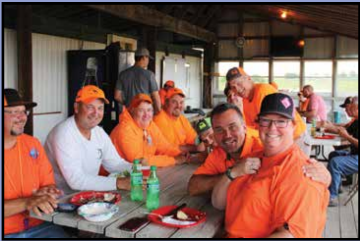
Thursday – awards dinner