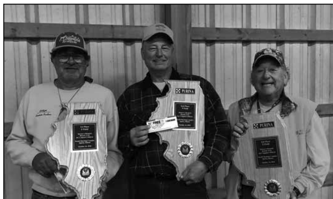
Shriners' Trial, Sunday – F field