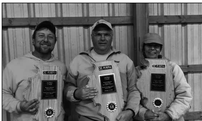
Shriners' Trial, Sunday – C field