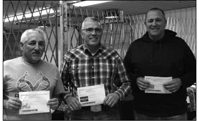
Illinois Benefit – B field