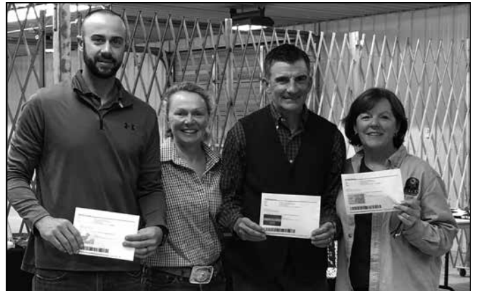
Illinois Benefit – D field