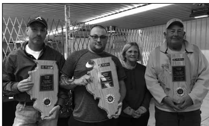
Shriners' Trial, Saturday – F field