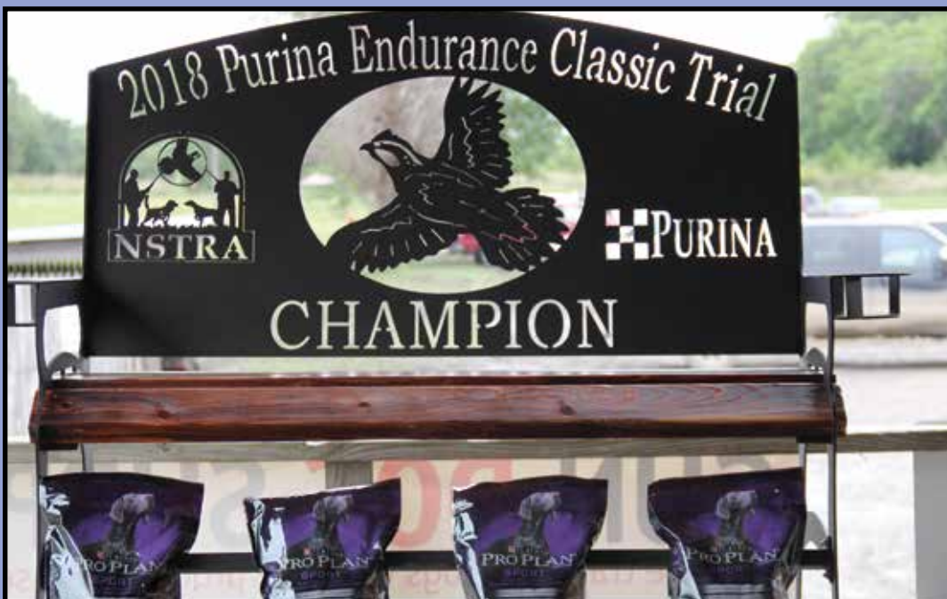
Custom Bench for the Purina Endurance Champion from Battle Born Metal Works in Reno, Nevada