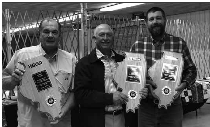
Shriners' Trial, Saturday – E field