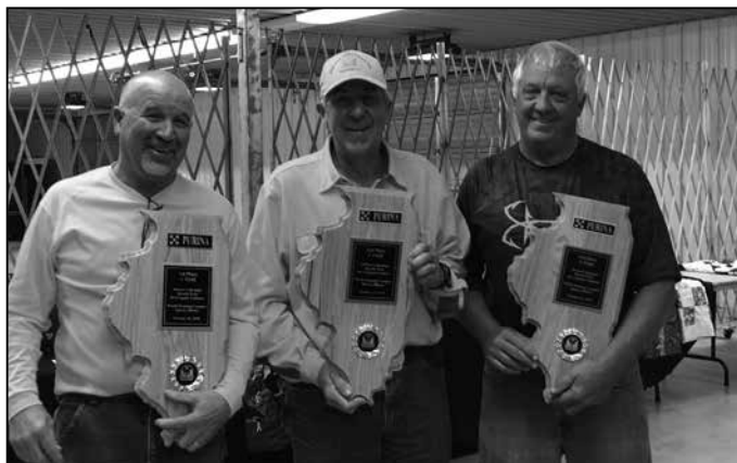
Shriners' Trial, Saturday – C field