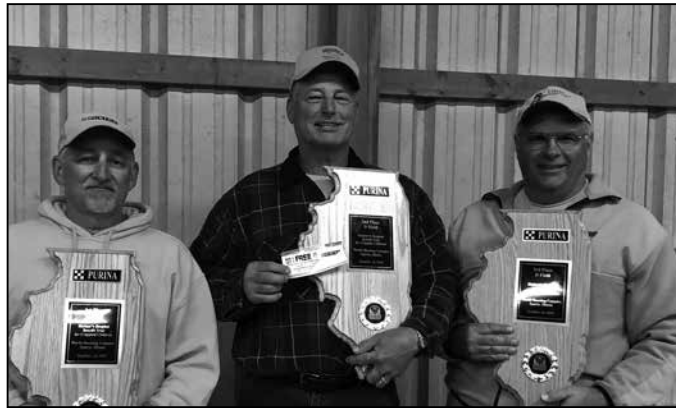
Shriners' Trial, Sunday – D field