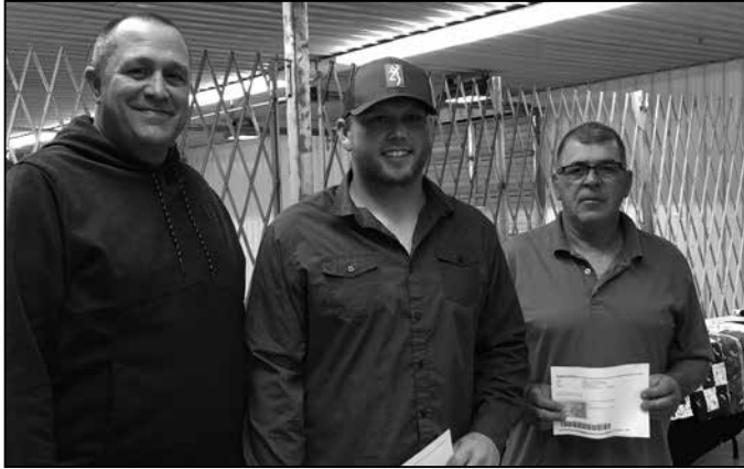
Illinois Benefit – A field