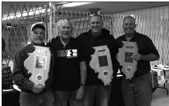
Shriners' Trial, Saturday – D field