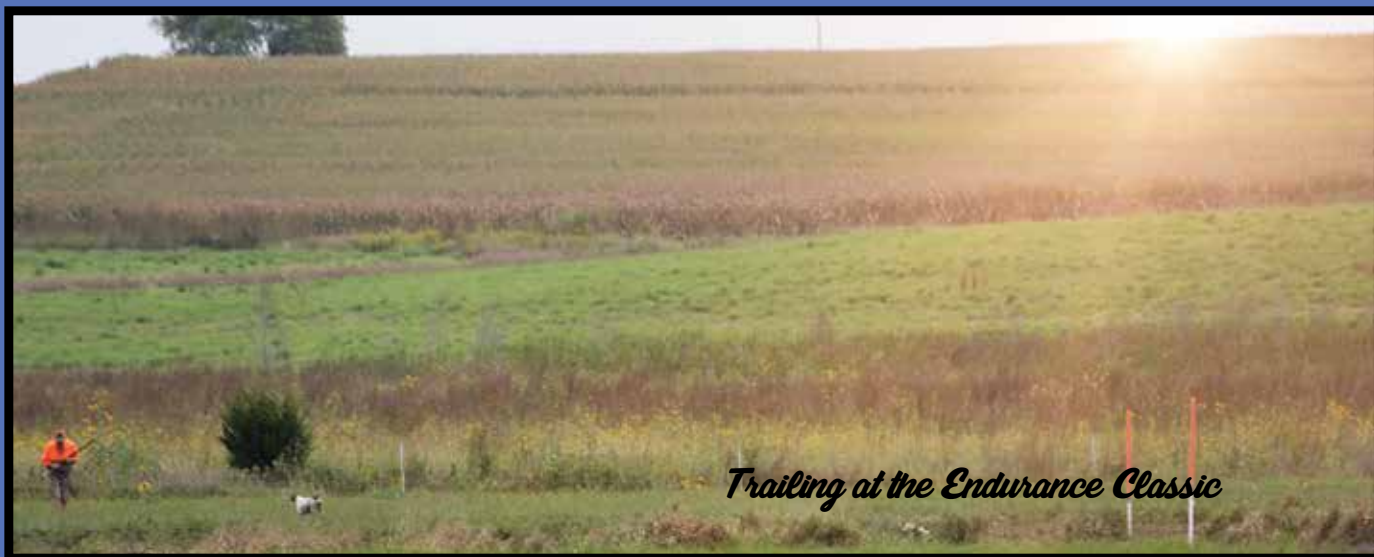
Trailing at the Endurance Classic