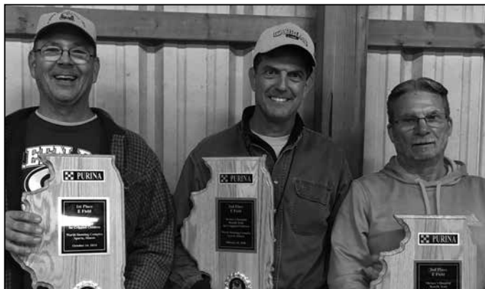
Shriners' Trial, Sunday – E field