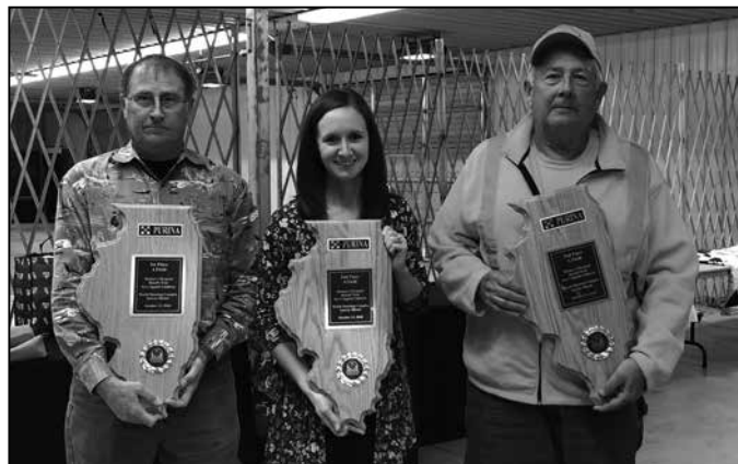
Shriners' Trial, Saturday – A field