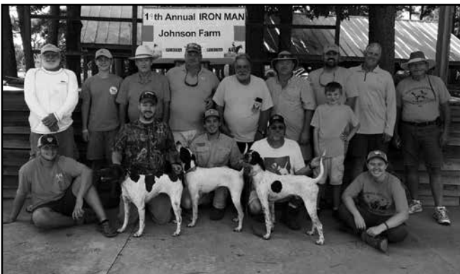
All from the trial.