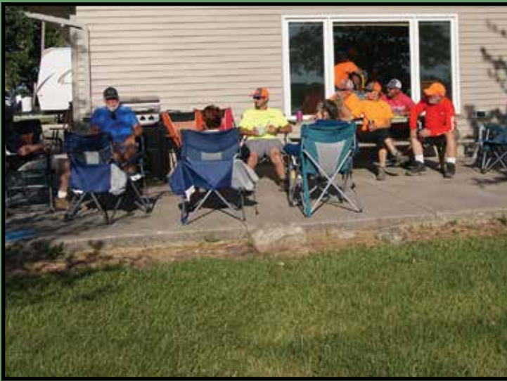
Relaxing after a long hot day