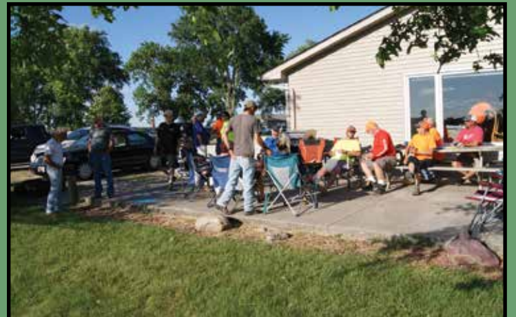
Many stories being told after a long day of trialing