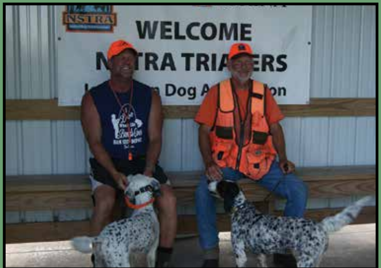
Final 2 in blind