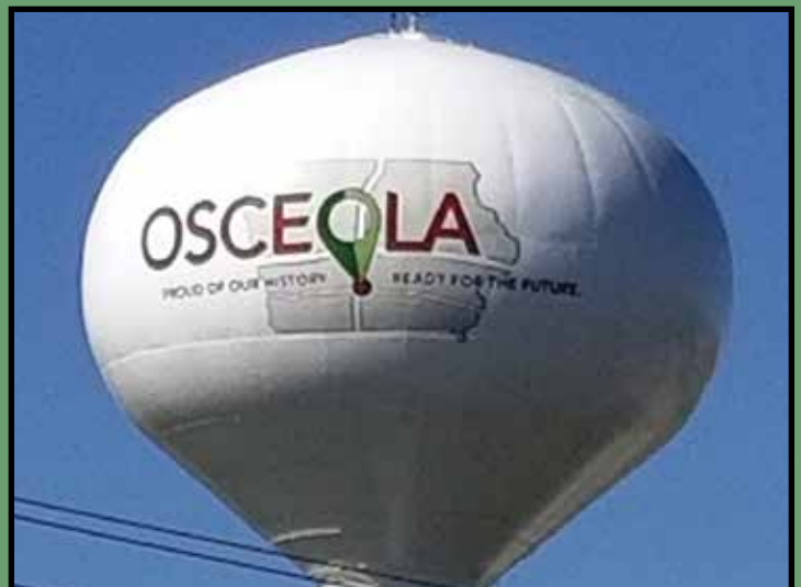
Osceola tower – Location of the 2018 UKC Performance