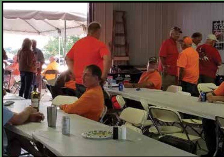
Visiting after the Wednesday night pig roast