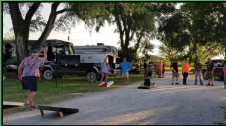
Several people playing cornhole after the pig roast