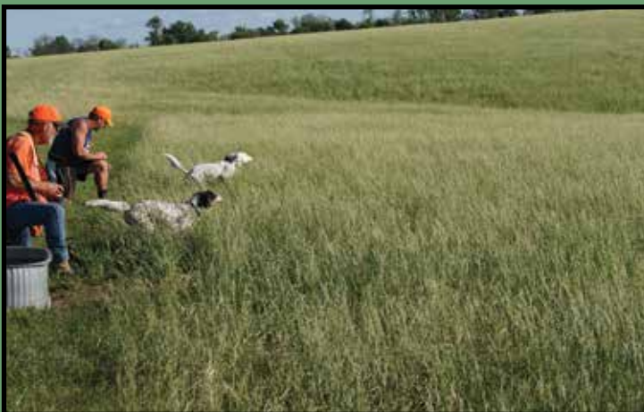
Final hour – Handlers ready, good luck, and turn them loose