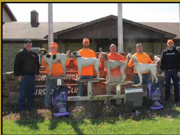
FINAL 4 PLACEMENT