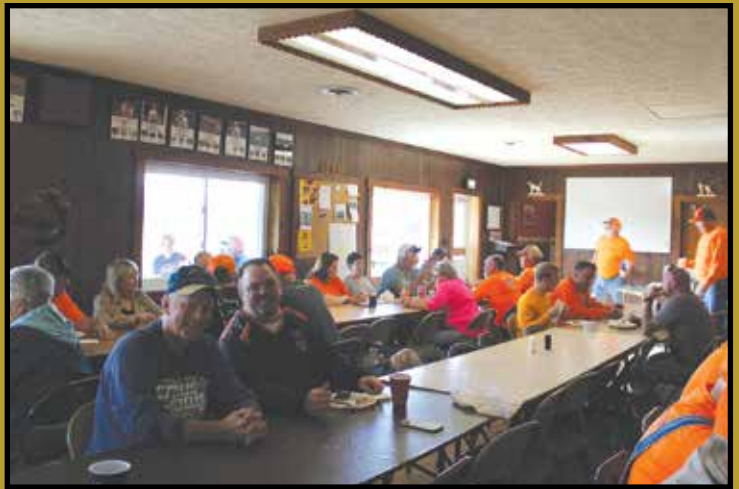
Thursday – awards dinner