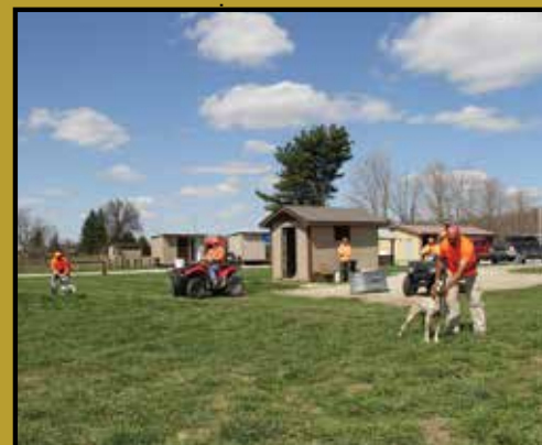
Greg Wood with Big Red & Philip Chandler with Tessa