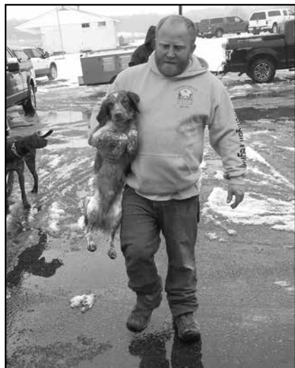
Headed to get their photoshoot!