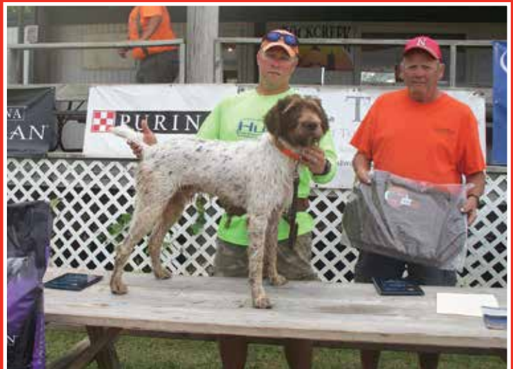
Boyt Harness Handler's Bag Presentation