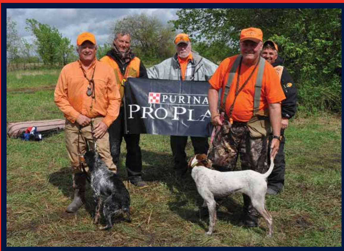
Members of the Lone Star Region

203 N. Mill St. Plainfield, IN 46168 (317) 839-4059