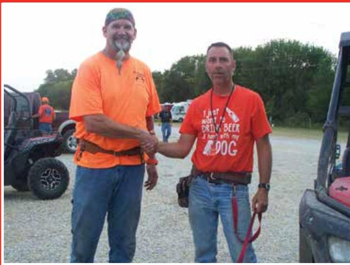
They're Back & Congratulations