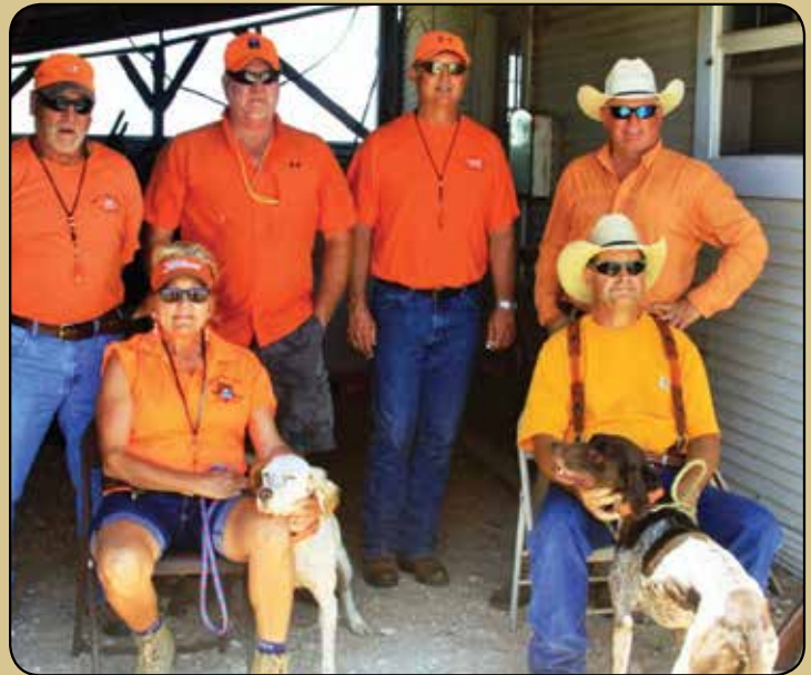
6 Handlers in the Blind

(L-R) WTX Regional Champion Barr's Smokin Moonshine R'Miley, 1st RU Jordan's Attaboy Joe, 2nd RU Smokin Hot Fannie, and Not pictured 3rd RU Hefty De Broughton