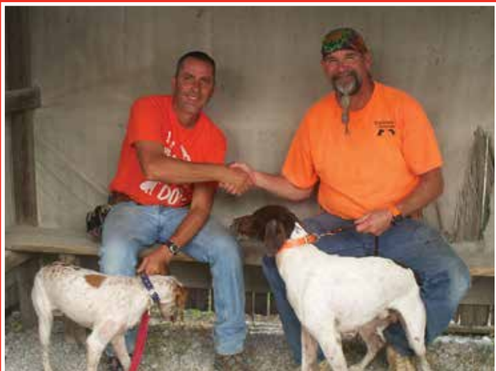
Good Luck Handshake