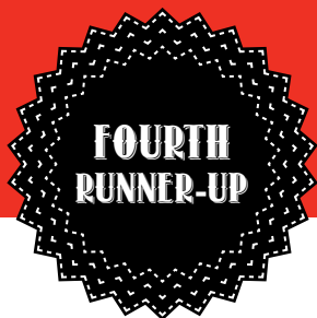
Whizbang Black Pearl (Pearl) Owned and handled by Chad Mantz Oklahoma Region