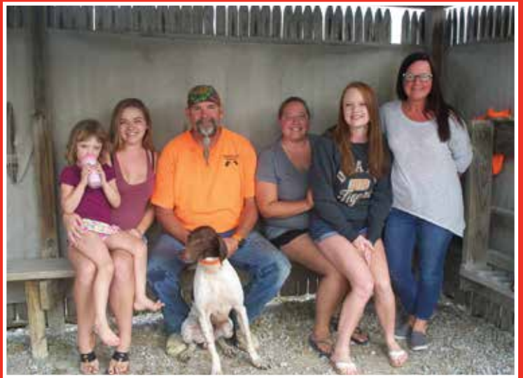
The Tangeman family