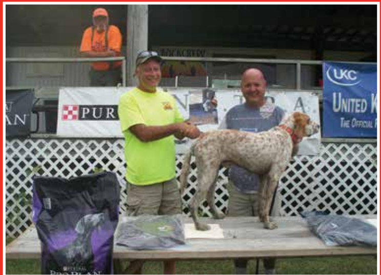
Dogs Unlimited Presentation