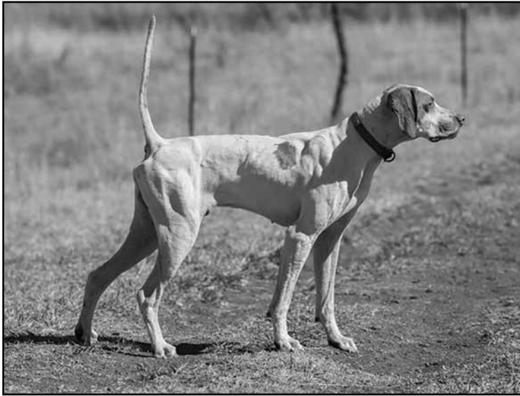
CH S F Bandwagon

HOF/NCH Funseeker's Rebel Deep Creek Rose