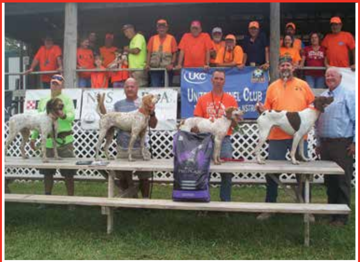
Top Four with Gallery