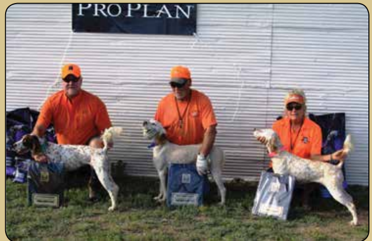
WTX Regional Championship Final Four.