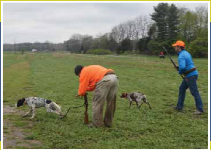
Let em go!