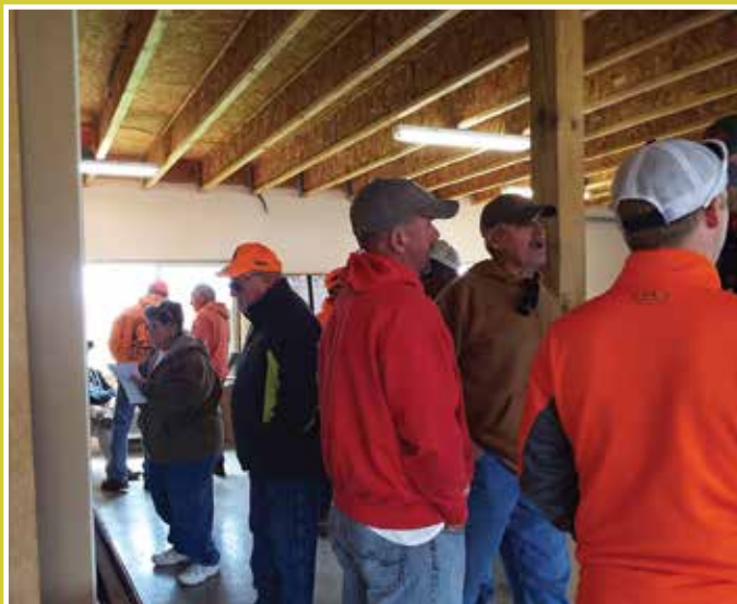
Waiting for scores to be posted