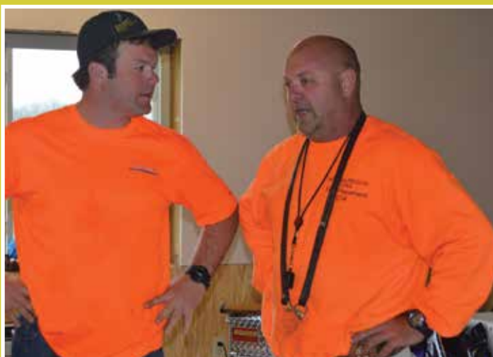
Waiting on the final scores