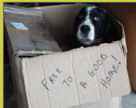
Someone trying to play a trick on Greg Wood with Jake!