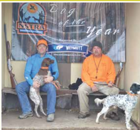
In the blind for the Final Hour