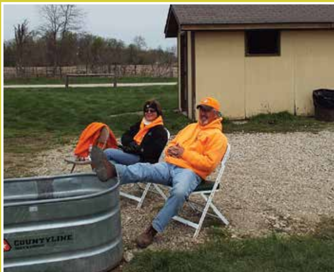
The Jaspering's kicked back & relaxed