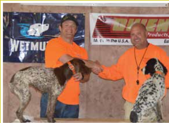
Congratulations are in order