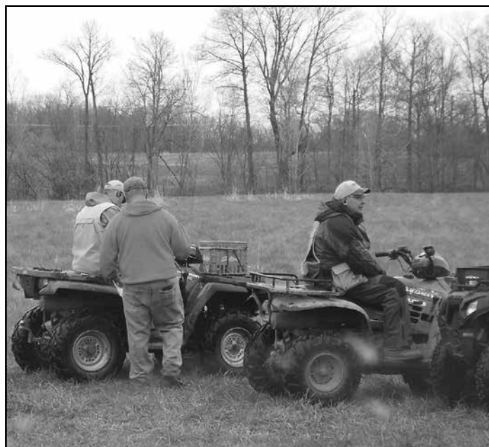
Handing out scorecards