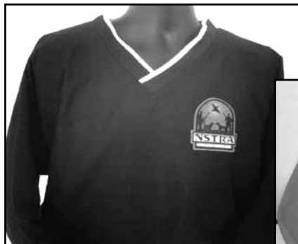
(A) Black Wind Shirt 100% polyester microfiber jacket. Wind & Water resistant S-4X

See you next at: The Trial of Champions..... Amo, Indiana