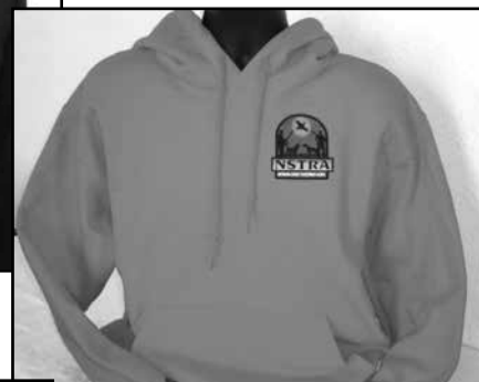
(B) Orange Logo Hoodie 50/50 cotton/poly S-2X