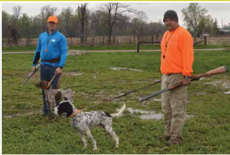
Ready to run in the mud and rain