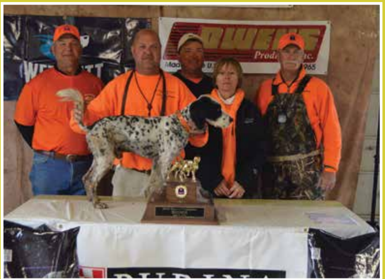
Champion & Officials