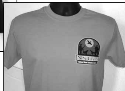
(D) Orange Logo Tee 50/50 cotton/poly S-4X