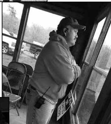
J-Dub watching the fields