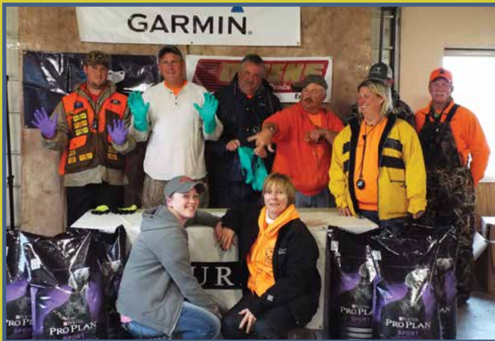
Trial Officials having a little fun...

203 N. Mill St. Plainfield, IN 46168 (317) 839-4059