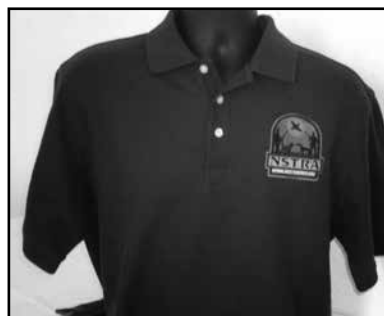
(C) Short Sleeve Polo (Navy) 100% combined cotton pique' relaxed fit S-4X