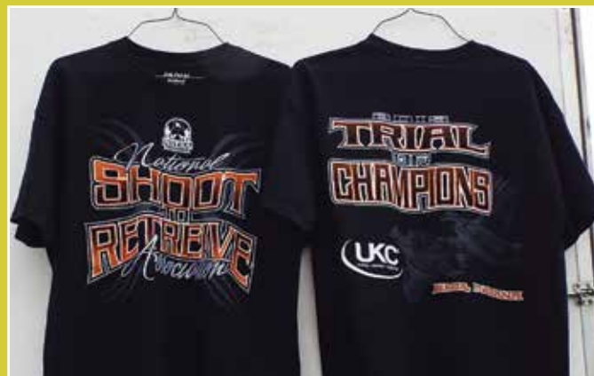
This year's shirt design....good job, Dion!