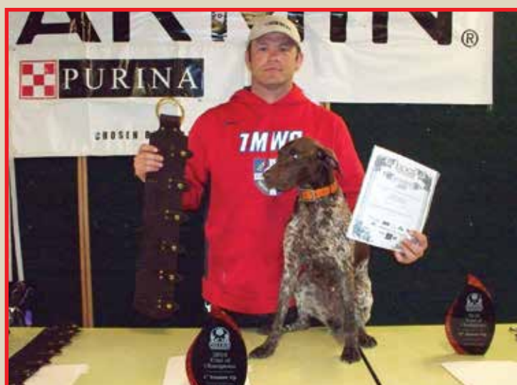
1st runner-up Adam & Nose presented Dogs Unlimited Award, Buckle Holder – Red Haw Supply