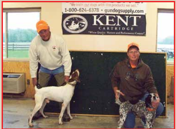
2nd & 3rd runner-up with Gun Dog Supply and Kent Cartridge