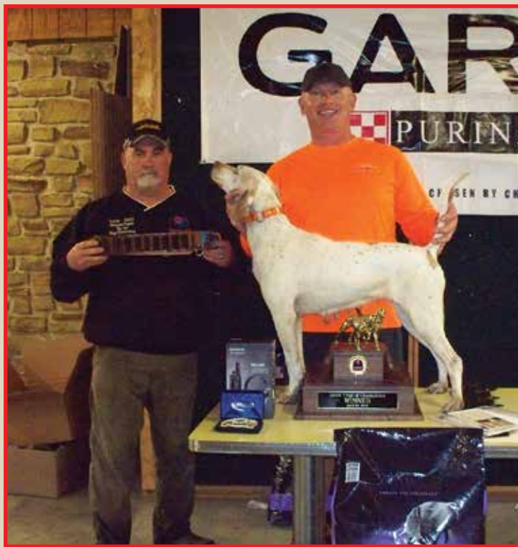
Shell Belt from Dying Breeds Award