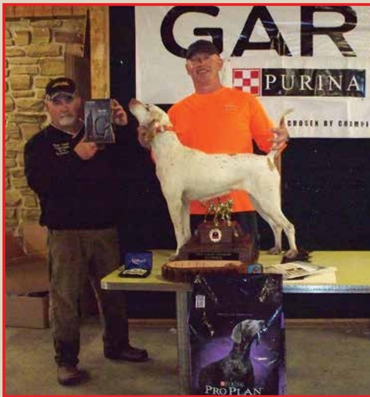
Chad being awarded the Garmin Collar