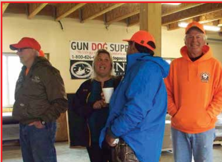
Just standing around