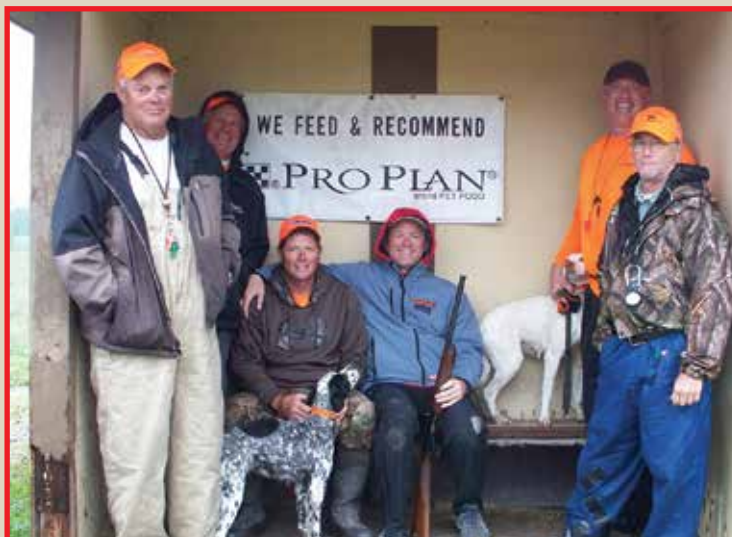
Top 6 – 1st