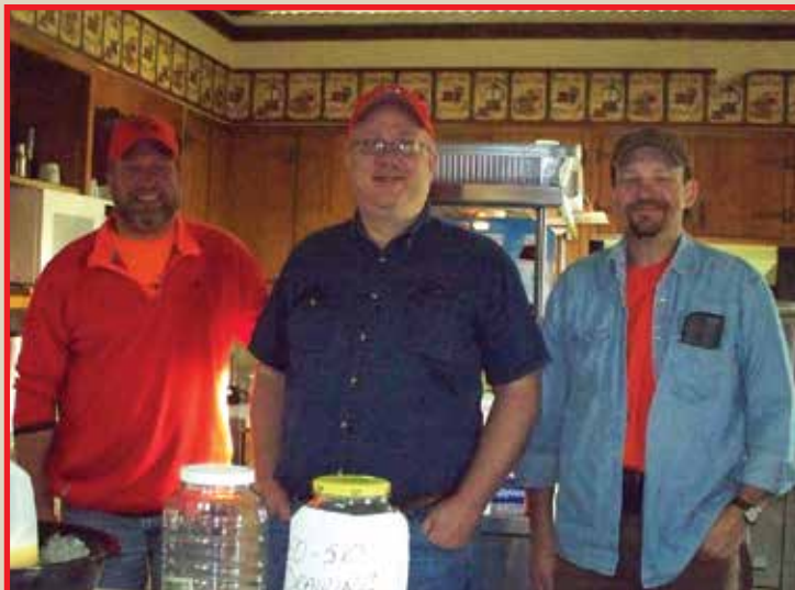
Part of the Kitchen Crew