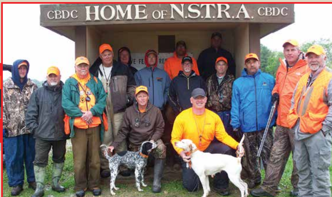
TOP 6 WITH OFFICIALS