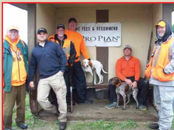
Top 2 with officials